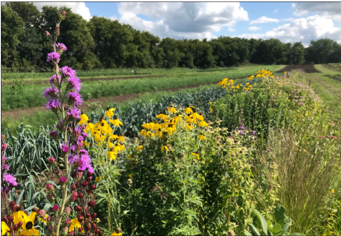
Strip of perennial flowers in vegetable field.