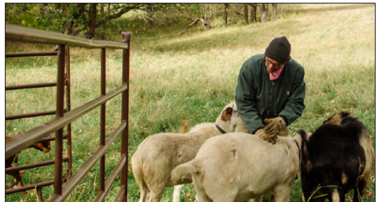
TOP: Chicken tractor at North Circle Seeds, Vergas, Minn. ABOVE: Goat at Paradox Farm, Ashby, Minn.

When integrating animals, pay attention to food safety. Pathogens that can cause