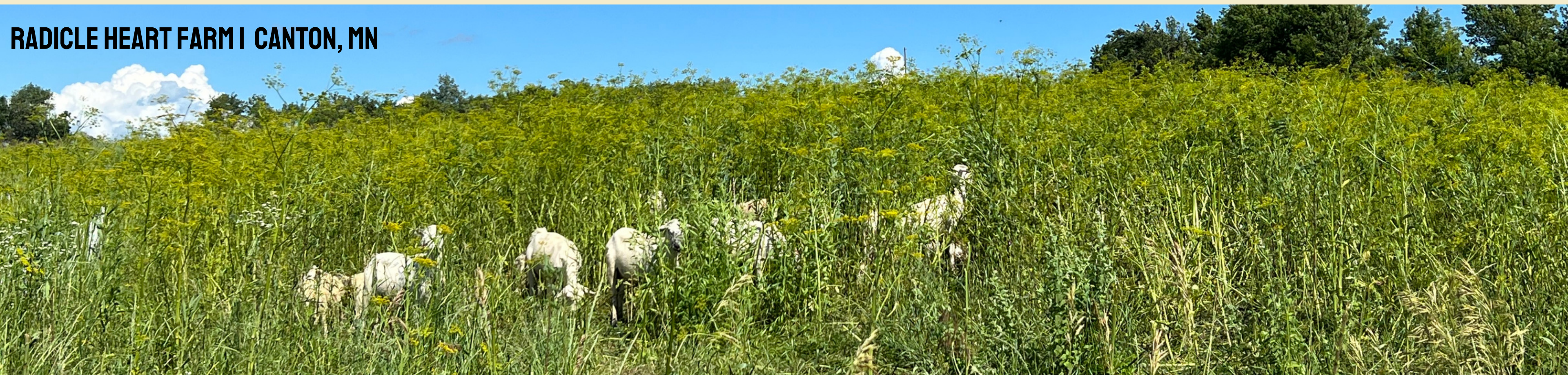
RADICLE HEART FARM | CANTON, MN