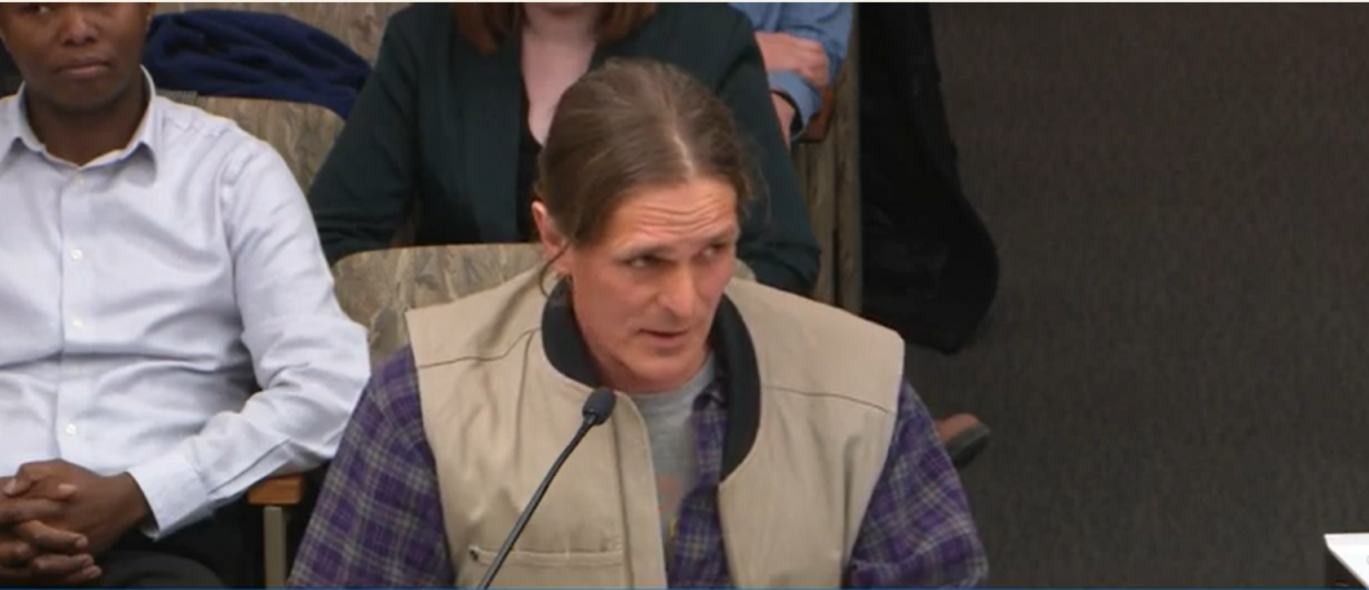
House File 2043 Farm-to-school program established; money appropriated.